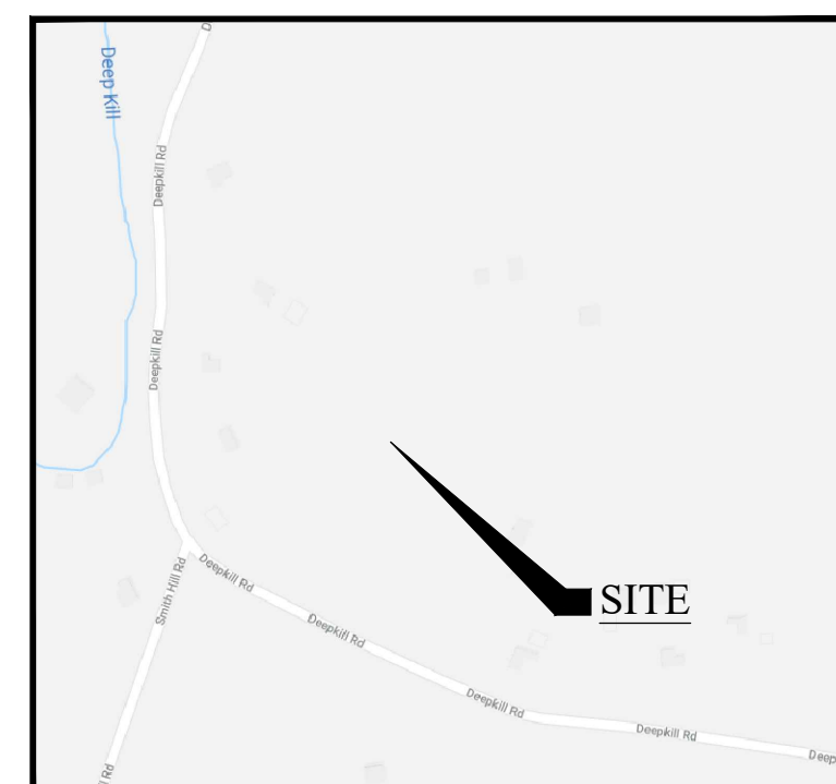
SITE LOCATION MAP N.T.S.